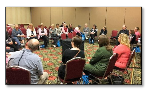
Upcoming Trainings IN PERSON: