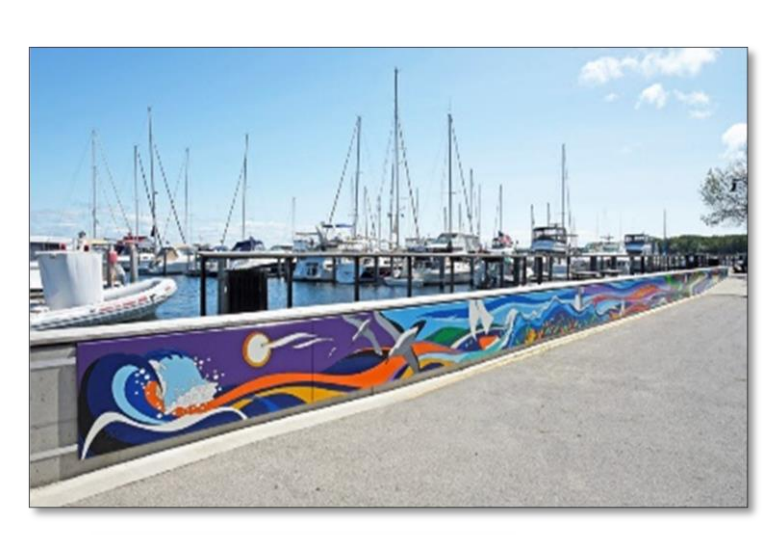
32" high, 109' long Marina Mural in Northport, The "Bay Presents"