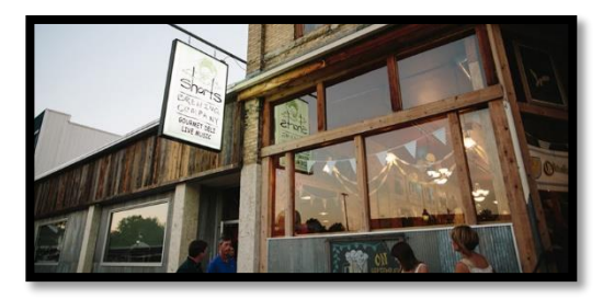
MCLS Community Engagement Roundtable Registration Form - Bellaire, MI Please complete the following form to register to attend the MCLS Community Engagement Roundtable on June 21, 2017 from 12:30 - 2:30pm (Eastern) at Short's Brewery, 121 N Bridge St, Bellaire, MI 49615. Register>>