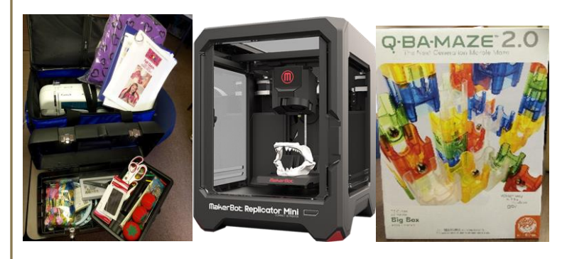
Don't forget to borrow a maker kit!!! Click here for <u>Librarika</u>