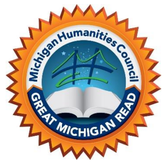
Great Michigan Read